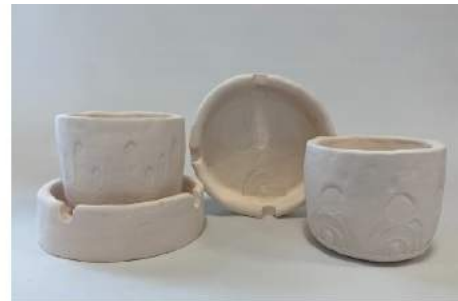
Shelby Dwyer Stamped Set Ceramics 2