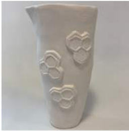
Chloe Coughlin Spriggedware Pitcher (front) Ceramics 1