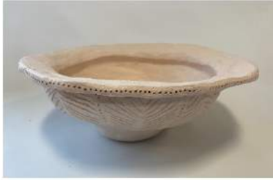
Nighen Dabiker Carved Coil Vessel (View 2) Ceramics 1