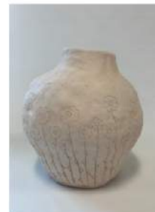
Ryleah Breckenridge Carved Coil Vessel Ceramics 1