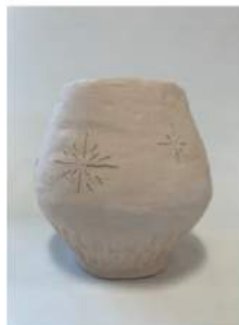
Cherra Harvey Carved Coil Vessel Ceramics 1