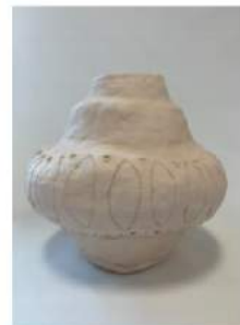
Lisa McBurnie Carved Coil Vessel Ceramics 1