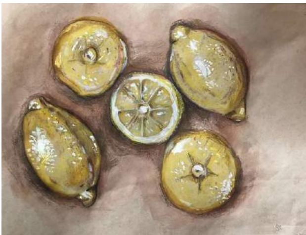
Summer Koegel Lemon Study HONORABLE MENTION