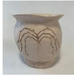
Brianna Esde Carved Coil Vessel Ceramics 1