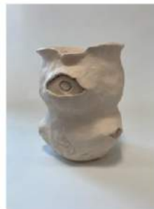
Will Jones Carved Coil Vessel Ceramics 1