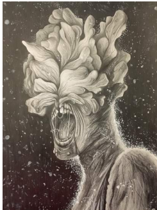
Chloe Calkins Clicked HONORABLE MENTION