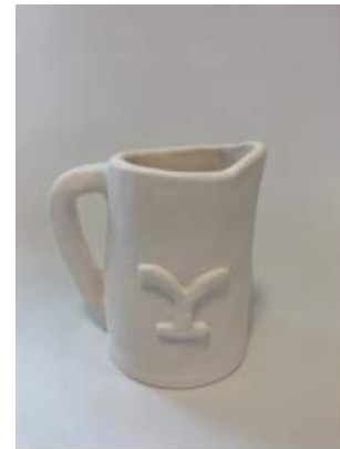
Alexis Dryer Spriggedware Pitcher Ceramics 3