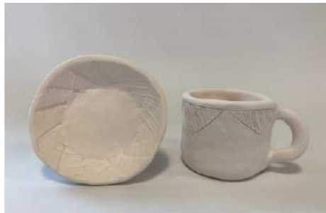
Mallory Hess Stamped Set Ceramics 2