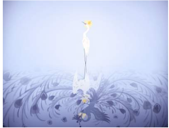
Kylie Russo The Influence HONORABLE MENTION