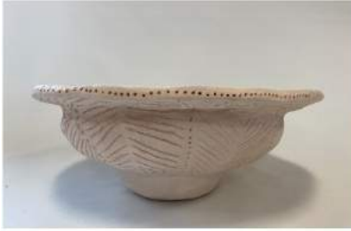
Nighen Dabiker Carved Coil Vessel (View 1) Ceramics 1