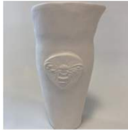
Chloe Coughlin Spriggedware Pitcher (back) Ceramics 3